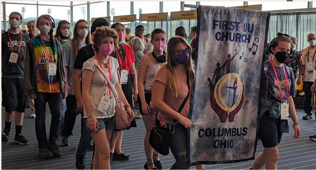
FIRST UU YOUTH CARRYING OUR BANNER IN THE PARADE AT GENERAL ASSEMBLY 2023