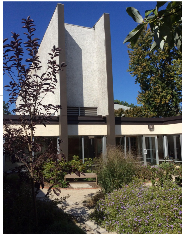
The courtyard looking toward the Window Hallway.

Hurricane Relief Funds The UUA and the Unitarian Universalist Service Committee are collaborating on recovery and relief funds. To learn more and to make a cash contribution, go to http://www.uua.org/ and click Recovery Fund button.