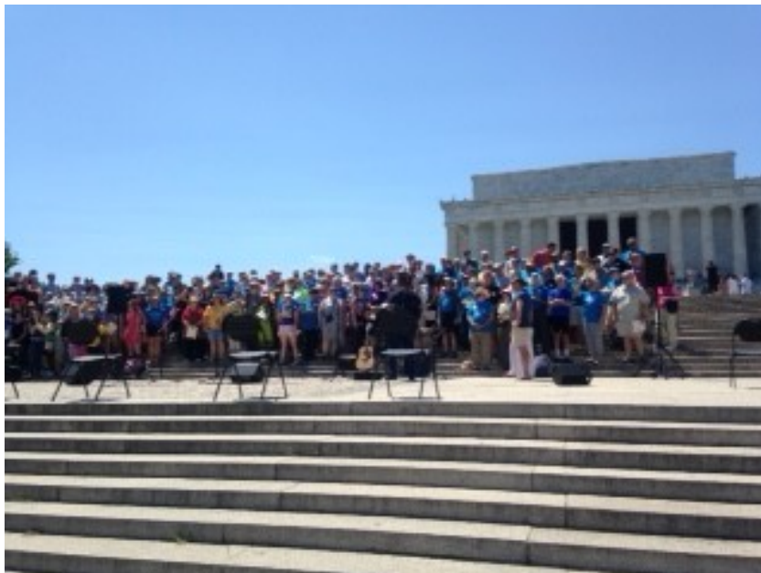
In front of the Lincoln Memorial

And this year, after the Sunday service, we all went downtown to sing on the steps of the Lincoln Memorial. How inspiring that was, to sing with Abe sitting majestically behind you, and the Washington Monument in front of you, surrounded by people from all over the world. It is fulfilling and humbling, to learn, again, that our church is well served by so many excellent musicians.